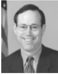
Bob Taft Governor